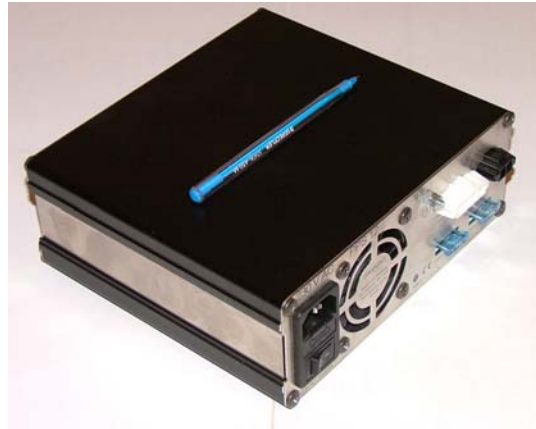
Close up of RFI & Transient protection circuit