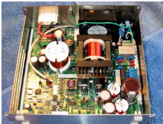
White lines on PCB indicate 6mm clearance between high and low voltage circuits (required for UL).